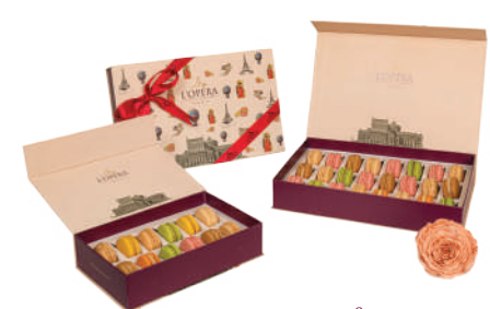
Macarons Box of 12 & 24