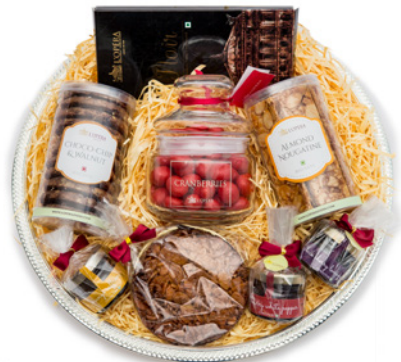
▣ Silver round tray ₹ 4500

For a full list of hampers options and to order online, please visit: www.loperaindia.com/order/