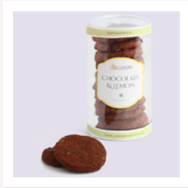
Chocolate & Lemon