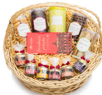
▣ Round basket ₹ 2999