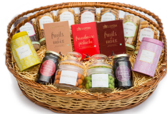
▣ Oval basket ₹ 7900