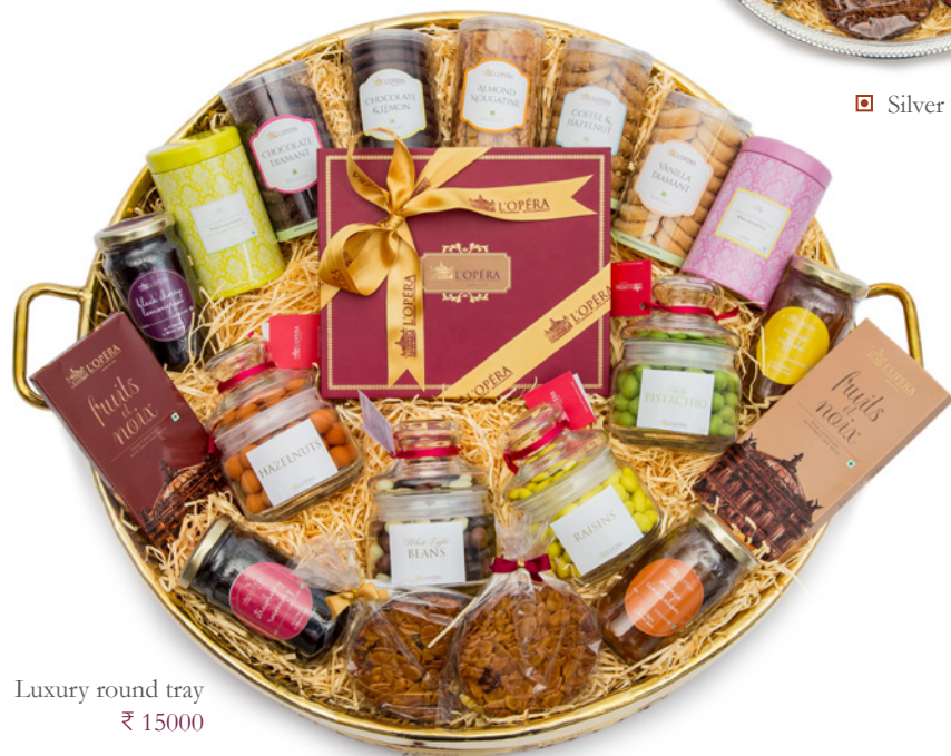
▣ Luxury round tray ₹ 15000