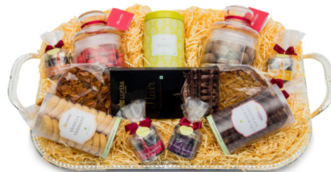
▣ Rectangular silver tray ₹ 5900