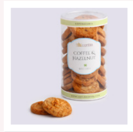
Coffee & Hazelnut