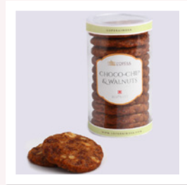
Choco-Chip & Walnut